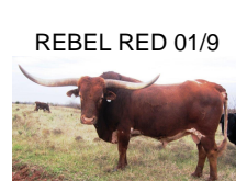
REBEL RED 01/9