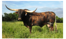
ANGEL FIRE 3/6