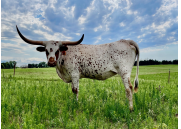
Candy Wine Iron Carmel